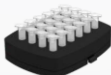
Micro Centrifuge Tube 20 x 1.5/2ml